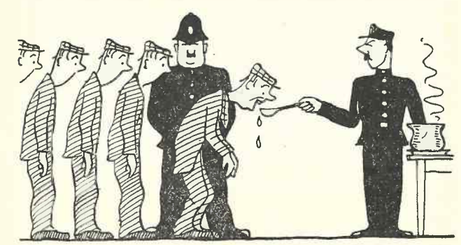
We shall be a well-planned, well-fed and obedient nation.

If the people could buy what they liked they would be able to live how they liked. Now, I have made an ex-